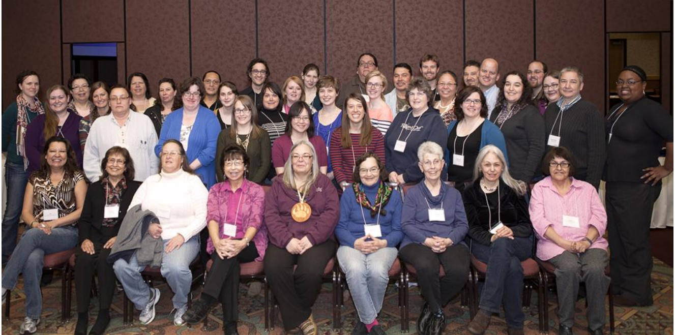
Photo: Culture Keepers at Lac du Flambeau, Wisconsin, May 2, 2013.